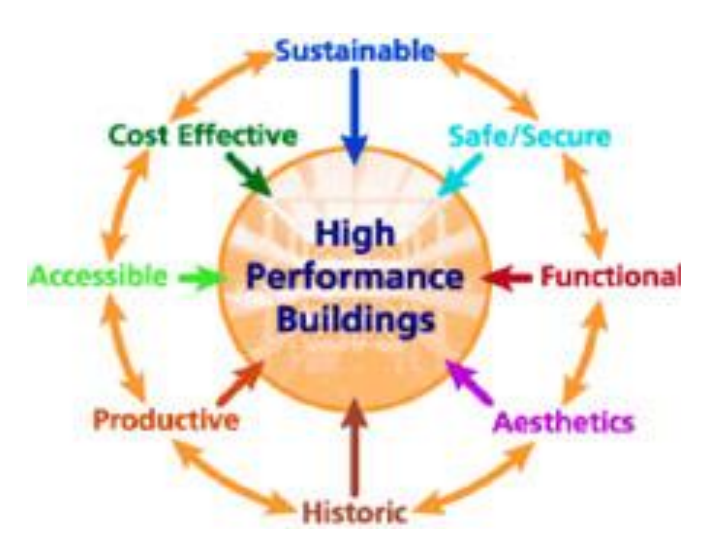
High performance building attribute diagram

Referred to as an integrated design approach, in this process "project goals are identified early on and held in proper balance during the design process [...] interrelationships and interdependencies with all building systems are understood, evaluated, appropriately applied, and coordinated concurrently from the planning and programming phase." In other words, before rehab even begins, the affiliate identifies specific project objectives; approaches and analyzes the building as a system of interrelated components; and develops a complete and realistic scope of work that meets these objectives.